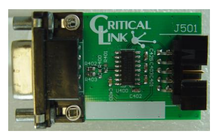
(1.8" x 1.2" – actual size)