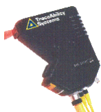
Mecco: Bumpy Bar Code Reader