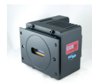
Critical Link: CCDsp Scientific Camera

Our clients choose the MityDSP to speed time to market; add exciting new features to their products; decrease development costs - when compared to in-house or outsourced from-the-ground-up development efforts, and allow their engineers and scientists to focus on advanced product features – not on the underlying platform.