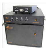
Anasys Instruments: nano-TA2™