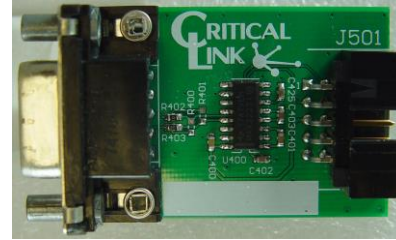
(1.8" x 1.2" – actual size)